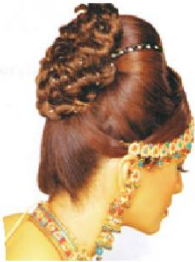
HIGHLY WESTERN BRIDLE