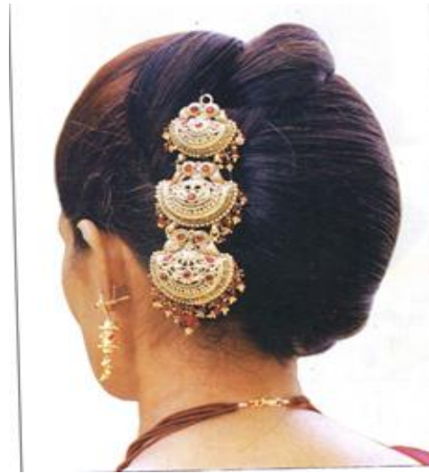
FRENCH ROLL IN LONG HAIR