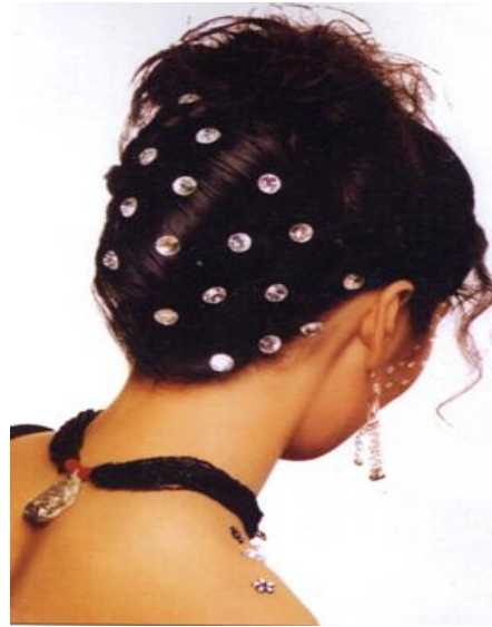
FRENCH WITH FUNKY