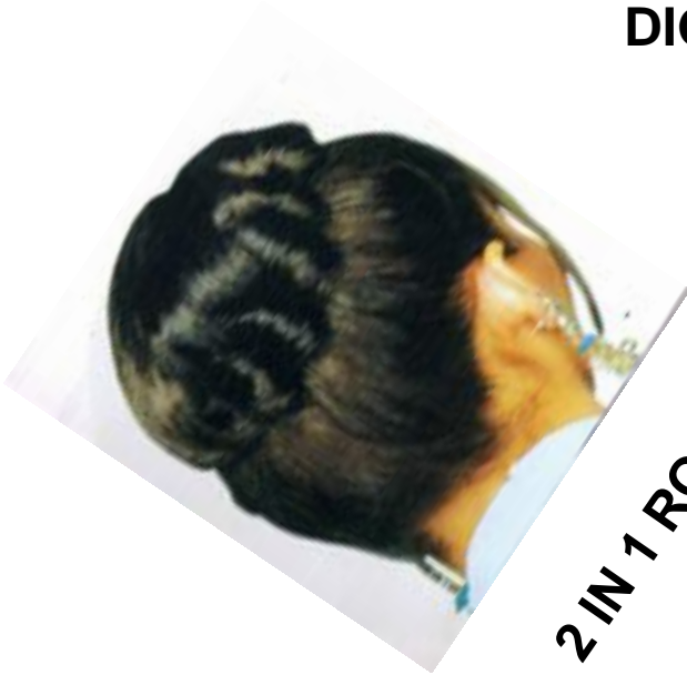
2 IN 1 ROLL