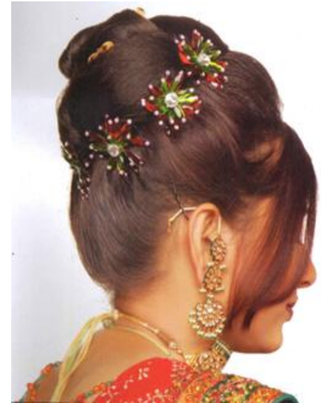
HIGH DIGNITY ROLL