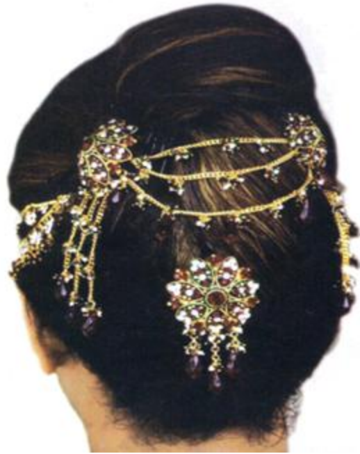
OVERIAPPING WITH IN ROLL